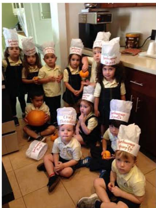
K-3b playing musical chairs (top left), enjoying outdoor playtime (right) and getting ready to bake pumpkin cookies (left)