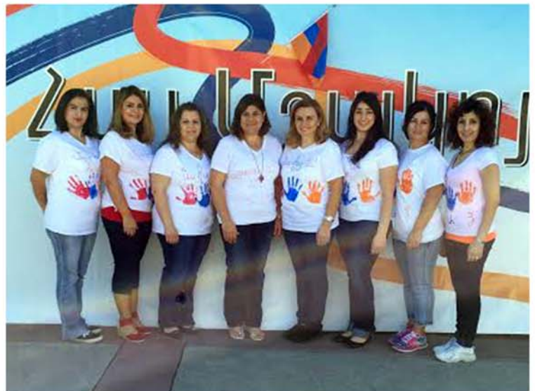
The Preschool teachers