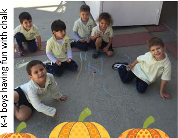
K-4 boys having fun with chalk