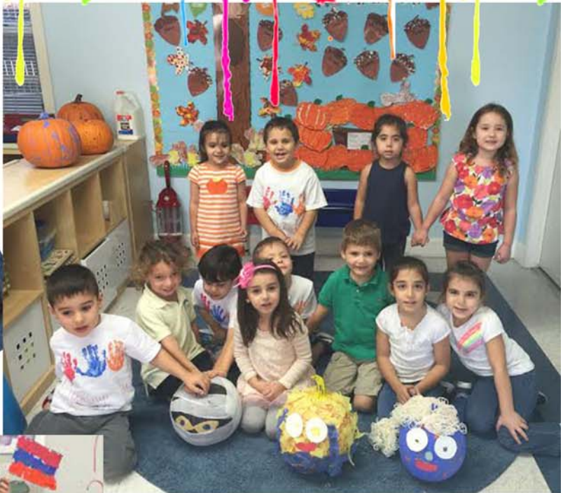
K-4 students with their decorated pumpkins