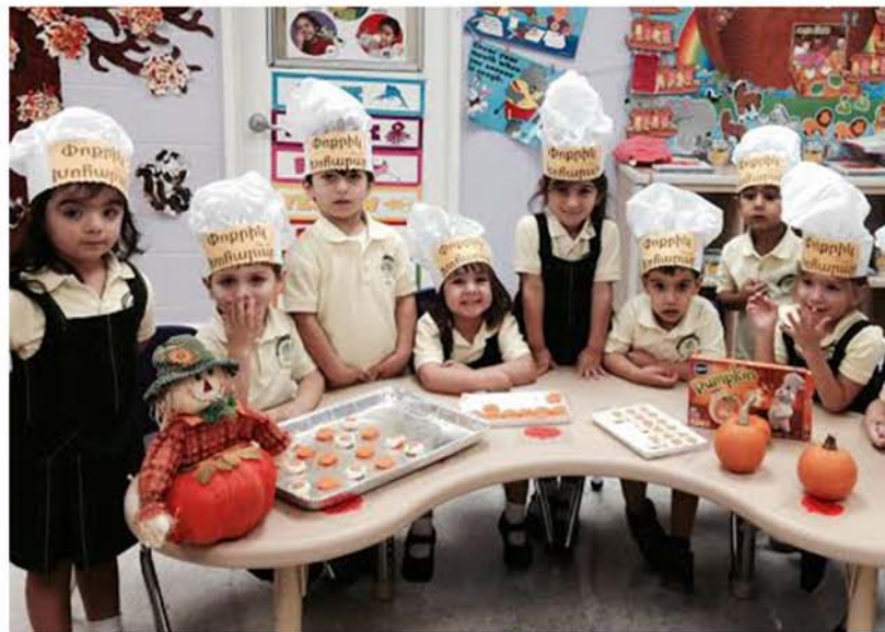
K-3a in their chef's hats preparing pumpkin cookies to bake!