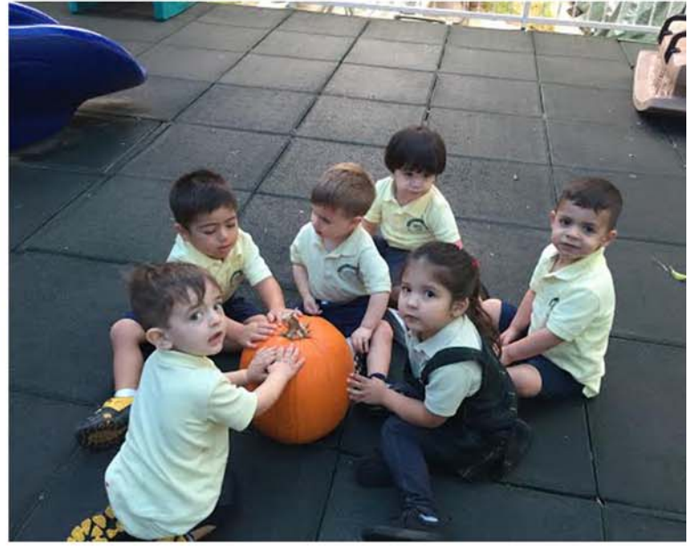
K-2 students with a large pumpkin in the playground