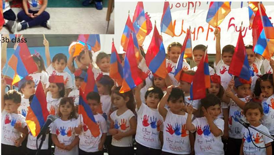
K-3 and K-4 students performing during the program