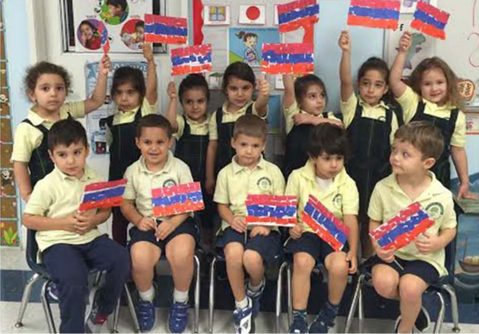
K-4 proudly holding the Armenian flags they made