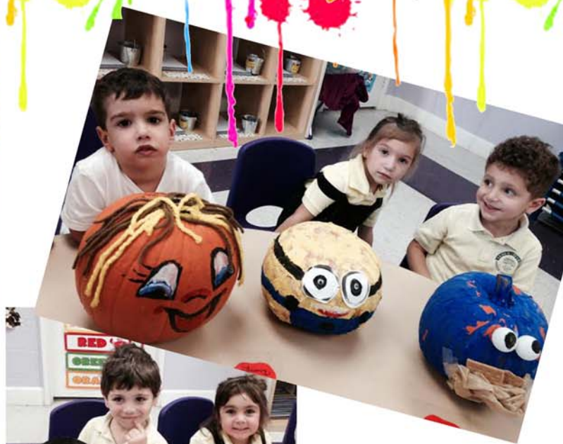
K-3a students with their decorated pumpkins!