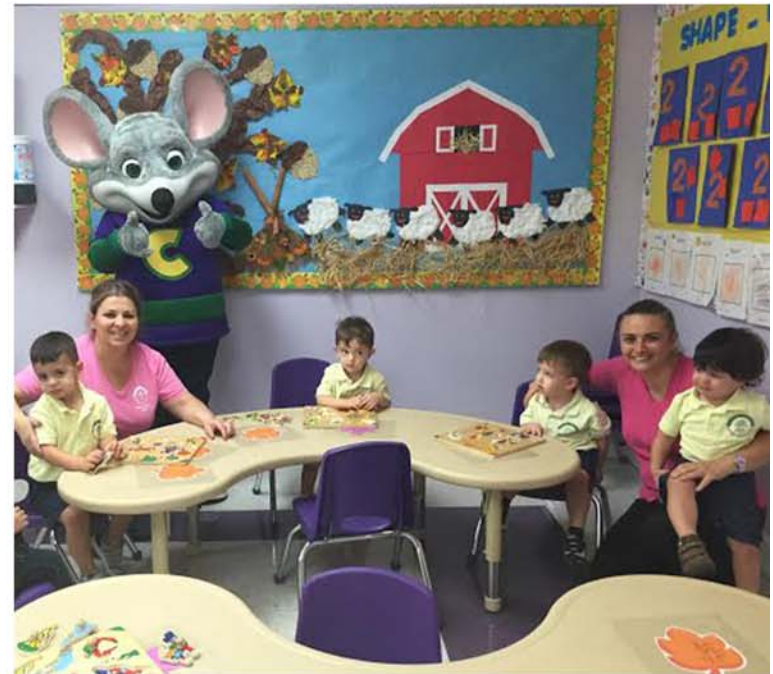
Chuck E. visited our K-2 class