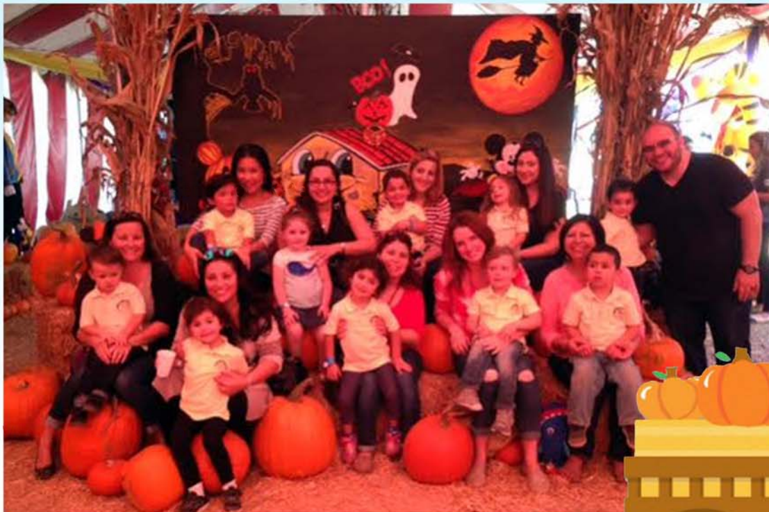
K-3b students and parents