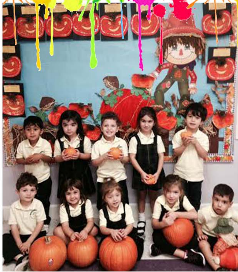
K-3a with their pumpkins before decorating them