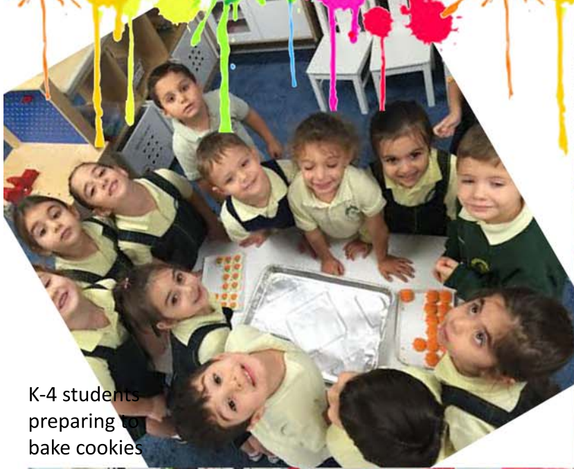
K-4 students preparing to bake cookies