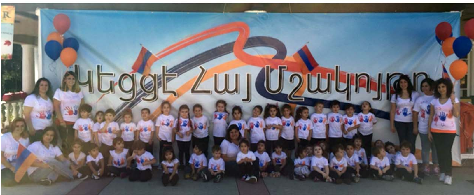
Preschool teachers and students are proud to be Armenian!

On October 22nd SMACS invited family and friends to watch a memorable presentation performed by our Pre-K classes. They walked up wearing their custom handmade T-shirts while holding our flag with bright smiles. With pride, they sang songs and recited poems in Armenian. It was definitely a day to remember.