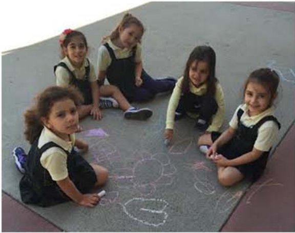
K-4 girls having fun with chalk