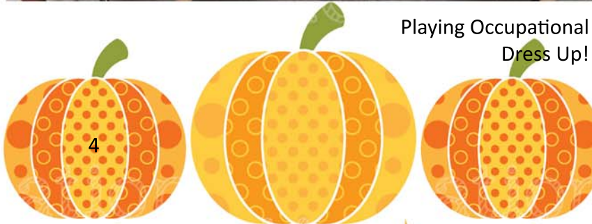
Playing Occupational Dress Up!