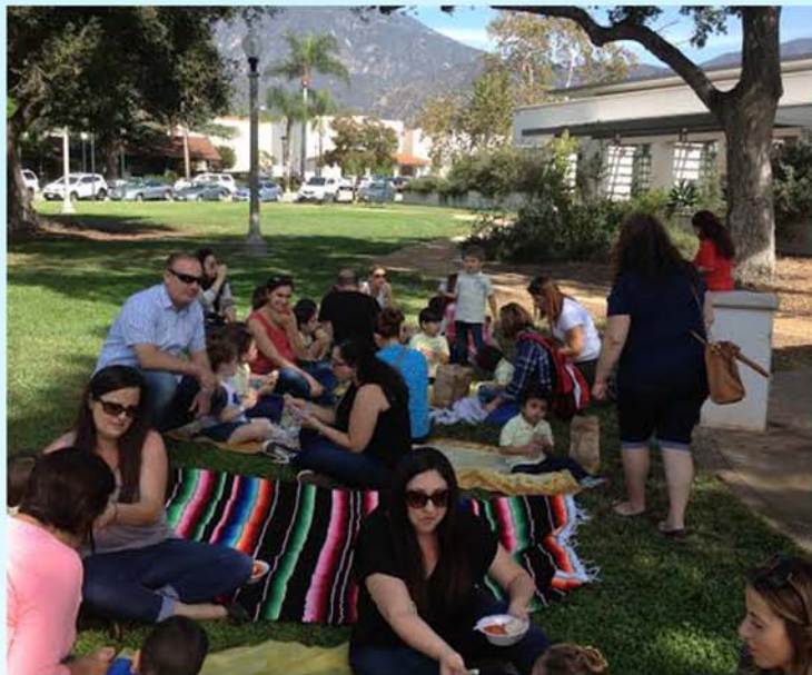
Everyone enjoyed a nice lunch in the park after the Pumpkin Patch