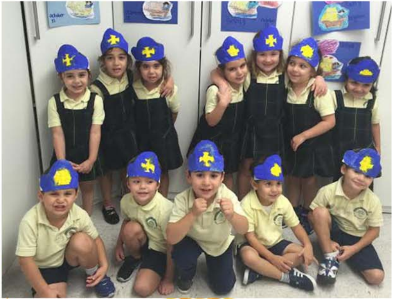
K-4 class with Columbus Day hats they made