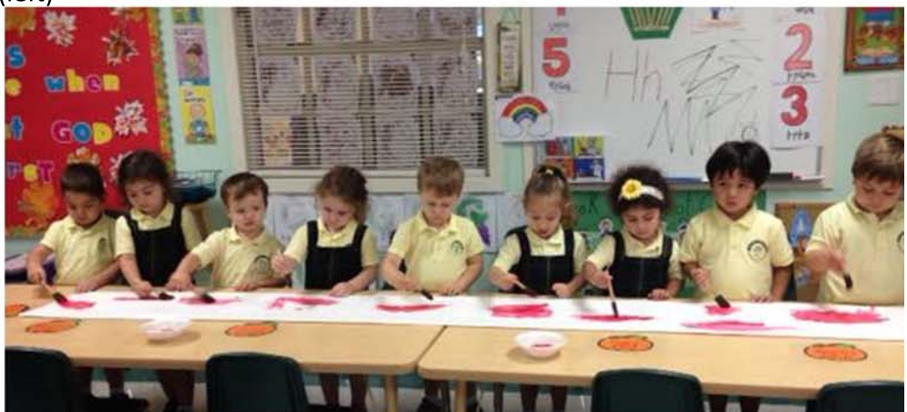
K-3b painting the Armenian flag