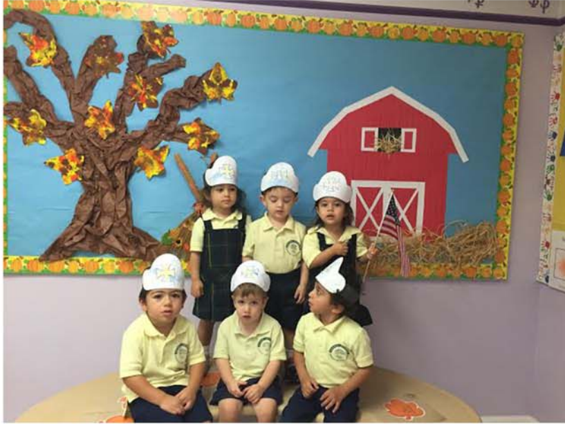
K-2 students wearing their Columbus Day hats